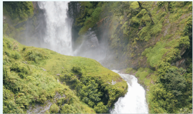
On way to Kodari