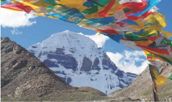
Holy Mt. Kailash North Face

We sincerely believe that if there is a place called "heaven" it is in the Himalayas, where many holy people have attained enlightenment.