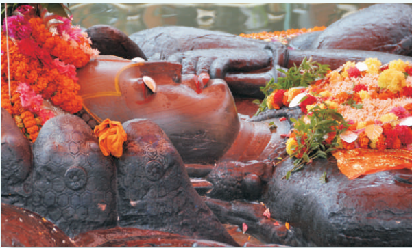
Kathmandu – Sleeping Vishnu Temple

"SKY" Shree Kailash Yatra makes a collective effort to bring yatries from all parts of the world to visit holy Mt. Kailash, Lake Mansarovar and other exciting places such as Everest Base Camp, Holy City of Lhasa, Muktinath, Janakpur and Valmiki Ashram. With the help of our experienced and trained staff, many yatries of varying age ranging from 11 to 86, have performed satisfying yatra.